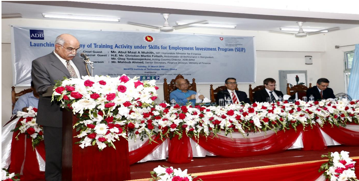
Inauguration ceremony of BACI-SEIP Project in 2015