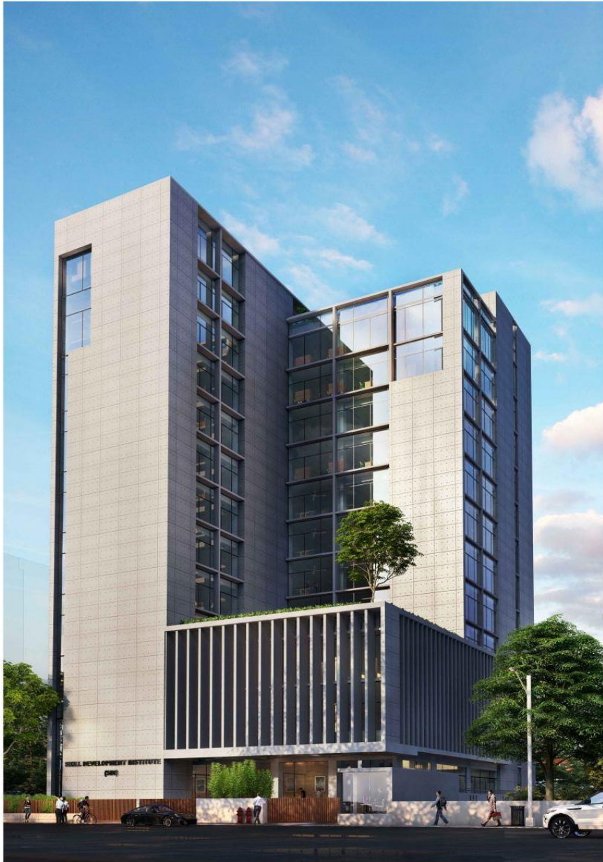
3D View of Future Development