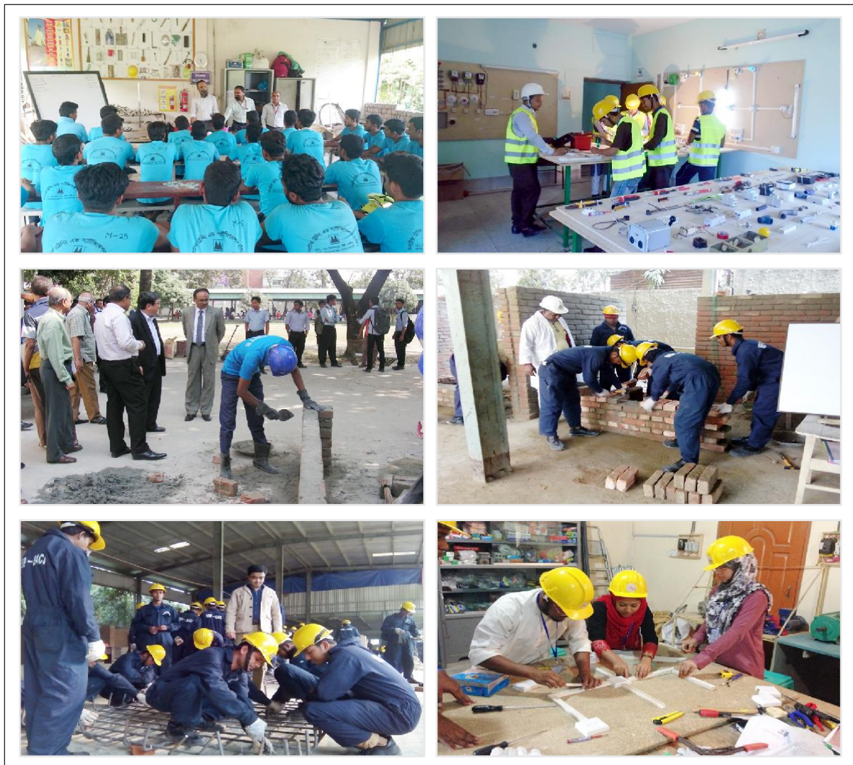
Class room & practical training of all trades & management course