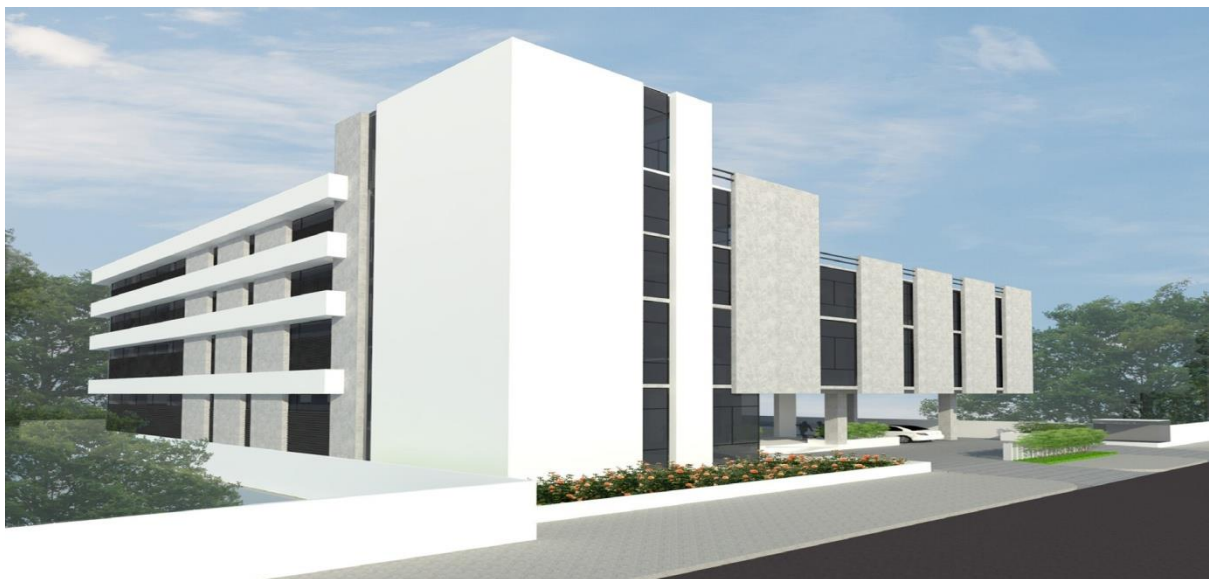
3D View of Skill Development Institute (To be built by SEIP within 2023)

Gradually, the training programs will be shifted from modular based to competency based aligning with NTVQF level. The trade related training course ensures delivery of occupational health & safety (OHS), OHS practice, hazard identification and control. Management related courses ensures demand driven approach to training with an objective to enhance the skill of existing workforce employed in various construction related industries to improve their knowledge, skills directly contributes to increase the productivity. At present 200 trainees are attending training course on different trades.